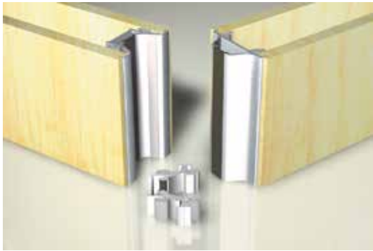
Concealed profile (K)