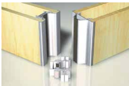
Protective profile (U)