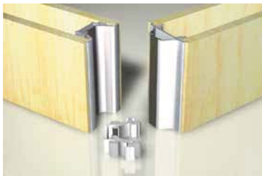
Concealed profile (K)